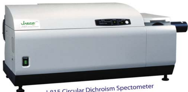
J-815 Circular Dichroism Spectrometer

JASCO's unparalleled optical performance and optionally available measurement modes make the J-815 a true "Chiro-optical Spectroscopy workbench." With the ability to measure CD, Absorbance, and Fluorescence versus wavelength and temperature on up to six samples at a time, the J-815 can provide considerable information to characterize samples faster than ever before. Also available are options for stopped-flow kinetics, auto titration, high-throughput CD and many others all controlled under the newly released Spectra Manager II™ software platform.