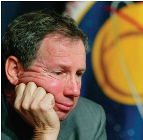
Unhappy family? NASA's Michael Griffin and his science advisers aren't on the same page.

Schmitt and members of that committee have clashed repeatedly in recent months over the role of science at the space agency. In a pointed 24 July memo to science committee members, Schmitt complained that they lacked "willingness to provide the best advice possible to Mike," refused to back Griffin's decision to cut research funds for astrobiology or recommend an alternative