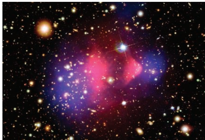
Dark evidence. A composite image depicting normal matter (pink) and gravity (blue) shows dark matter's presence in the "bullet cluster" of galaxies.

Speaking this week at a NASA briefing, astronomers reported on new Chandra images of the "bullet cluster" of galaxies, 1E0657-56, created by an energetic collision of smaller clusters. It is the most explosively violent such merger ever observed, said astrophysicist Maxim Markevitch of